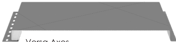
Versa Axes 12 in x 1 in x 3 ft to 60 ft