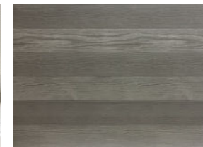
6 planks | 6 shades