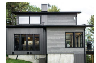
mixed shade result