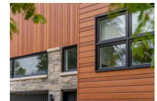
mixed shade result