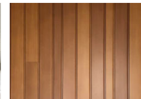
6 planks | 6 shades